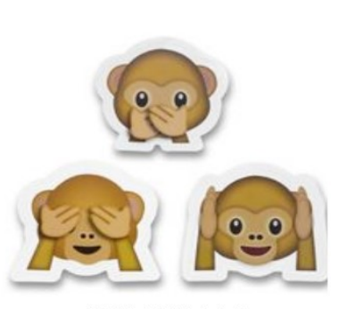
WE HAVE A WICKED PROBLEM TO RESOLVE!